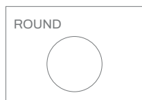
Table top possibilities